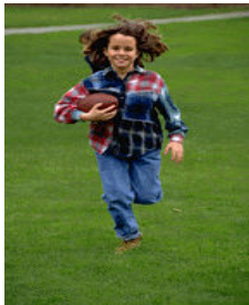
Keeping Communities Safe

Heritage Hills, Heritage Hills East, and Mesta Park are part of a security council known as Historic Neighborhoods Security Association (HNSA).